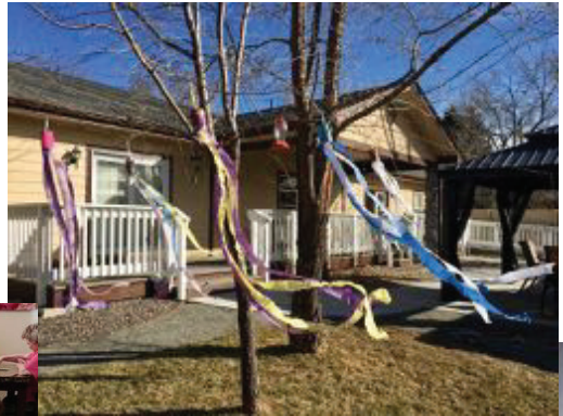
Spring is coming! Wind socks created by residents