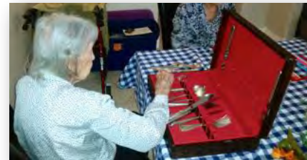
Sensory Outings Visiting Activities Group