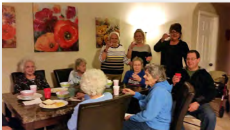
Valentine's Day Party